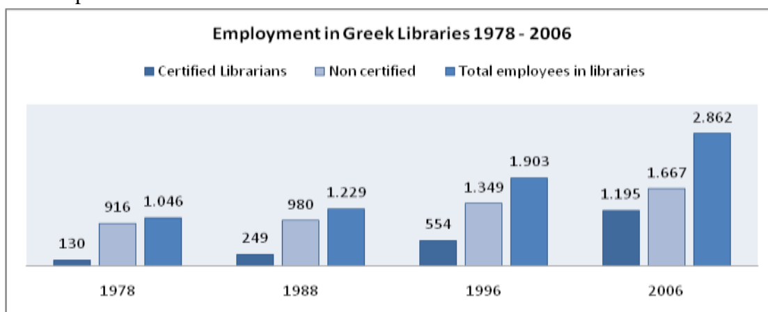
Figure 1: Employment in Greek Libraries.

Science (in 1977), but, at the same time, the number of library employees without a degree in Library Science has also increased. It should be noted that according to the NSSG in 2006 there were 591 libraries in Greece but this statistical record does not include private and school libraries.