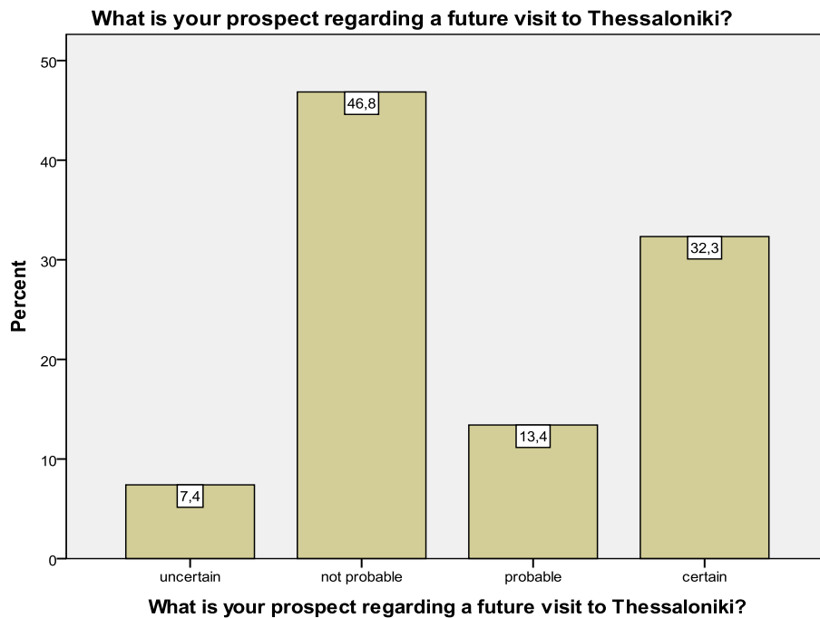
Figure 2. Tourist Loyalty to Thessaloniki

We perform t-tests with two independent samples consisting of men and women tourists about the following characteristics: (b1) equality of the mean scores of satisfaction from visiting Thessaloniki, t-test statistic=1,708, degrees of freedom=952, p-value=0,001. (b2) equality of mean scores of opinions about Greece, t-test=-3,855, degrees of freedom=936, p-value=0,0001.(b3) equality of annual income, t-test=3,327, degrees of freedom=954, p-value=0,0001. The conclusion is that the above characteristics of the tourists are dependent on their gender.